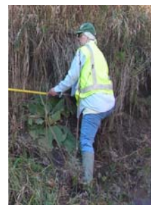
November 2009 - Kathy Giszczak working with volunteers to install erosion pins in the Paint Creek sub-watershed of the Stony Creek Watershed just south of I-94 off Huron/Whittaker Road.

background for over 25 years and my organizational skills.