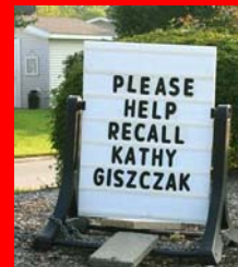
Augusta Woods sign at the community entrance.

See the full Gazette article online at http://augustapride.org